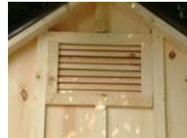
WOOD END VENTS