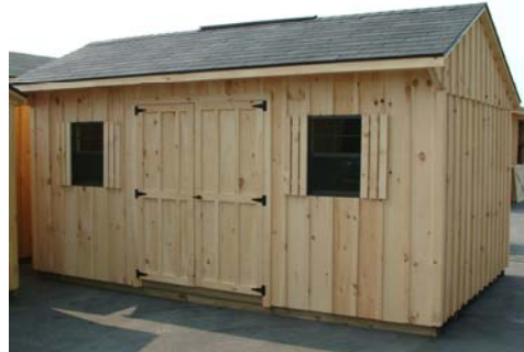
A-FRAME & QUAKER STYLES